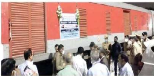
24/10/2021 BENGALURU Pg 02

Being time-tabled trains with lesser transit time, customers will be able to transport parcels in bulk quantity. In the first 3 years, no escalation in freight will be allowed but 10 per cent of escalation will be permitted from the 4th year. The service is expected to attract transport from road traffic to railways.